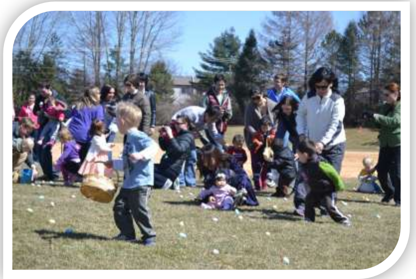
CRPR Annual Easter Egg Hunt