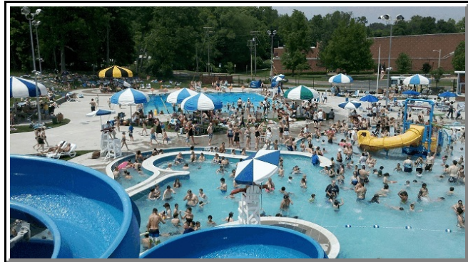
Wm. L. Welch Community Pool - Summer 2012

Serving the Borough of State College and the Townships of College, Harris, Ferguson & Patton